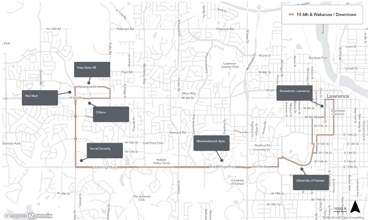
Route 10 - Current

Route 10 currently travels between Downtown, KU, and 6 th & Wakarusa and passes by Meadowbrook Apartments, Social Security, Dillons, Free State High School, and Wal-Mart. A map of the current route is shown below.